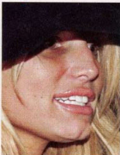
Black-and-blue or just tired in L.A. on January 11?